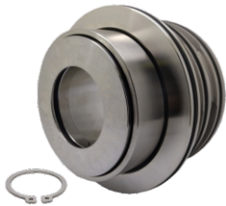
SFD - 60