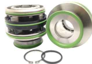
SFDGP - 45