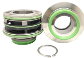
SFDGP - 60