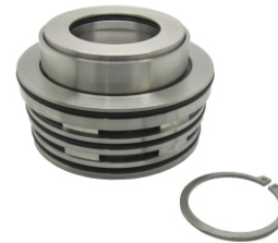
SFD - 90