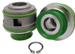
SFDGA - 25