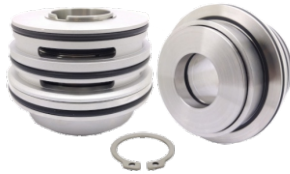
SFD - 35