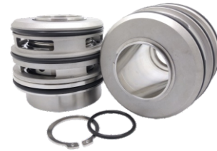
SFD - 45