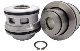
SFD - 25