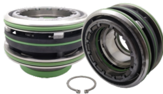
SFDGP - 90