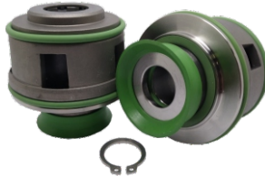
SFDGA - 20